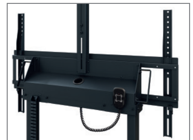
Cable management via cable drag chain