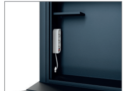
Lockable media cabinet