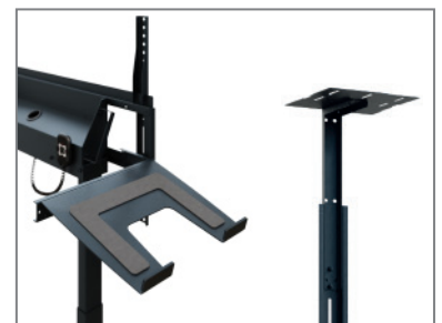
Extendable with laptop / camera holder